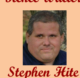
Celebration of Worship Through Song

"Praise God From Whom All Blessings Flow" "Blessed Assurance"